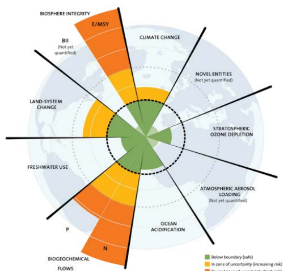
Figure 1: Planetary Boundaries (Steffen et al. , 2015)

Deforestation, for example, which is part of biosphere integrity, also exacerbates climate change because of reduced carbon storage in trees. The pressure on the environment is projected to increase further in the future, as the world population is rising, and as developing countries want and need economic growth to escape poverty. At the global level, this creates a dilemma between the desire to expand economic activity for a large part of the global population, and the need to restrict the use of resources and humanity’s environmental impact.